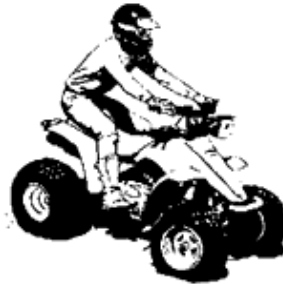
Figure 3. Shift into low gear and point the ATV directly downhill when descending a slope

Before descending a hill, you should shift the transmission into a low gear and point the ATV directly downhill. Keep both feet firmly on the footrests and slide back on the seat to increase your stability and the effectiveness of the brakes. (See Figure 3)