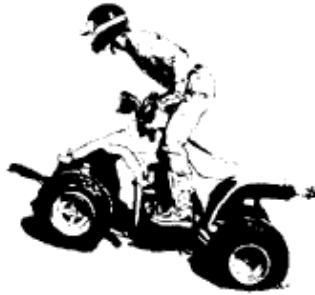
Figure 2. Keep both feet firmly on the footrests and shift your body weight forward when climbing a hill

The first rule to remember is to stay off hills too steep for your ability or that of your ATV. When approaching a hill, you should keep both feet firmly on the footrests and shift your body weight forward by sliding forward on the seat. For steep hills, stand on the footrests and lean forward to shift as much weight forward as possible. To reduce the chance of stalling the engine, climb hills in a low gear. If the engine does stall, you must apply the brakes before the forward motion stops. If your ATV stalls and then rolls backward, apply brakes slowly. Rapidly applying brakes during a backward roll can cause a rear overturn. (See Figure 2)