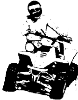
Figure 4. Keep both feet firmly on the footrests and lean your body uphill when crossing slopes

Avoid crossing steep slopes and slopes where there is slippery or bumpy terrain. If you do ride across slopes, keep both feet firmly on the footrests and lean your body uphill. If the ATV begins to tip, turn the front wheels downhill. If the terrain prohibits your turning downhill, dismount on the uphill side immediately. (See Figure 4)